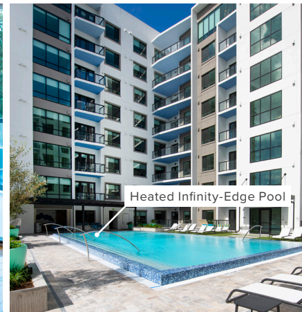
Heated Infinity-Edge Pool

With custom finishes and exclusive features that multifamily developers want, Lake House rises above the rest of the market.